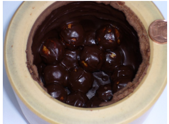
Fig. 3: Cocoa after grinding for 2 minutes

In the example the 250 ml zirconium oxide grinding set equipped with 20 mm balls was used. 50 g weighed-in-quantity is after 2 minutes the most beautiful chocolate. The first look inside the opened grinding set leaves nothing to be desired in regards to the fineness and homogeneity. The high application of energy does influence the sensory testing though.