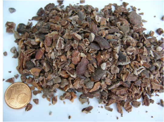
Fig. 1: Initial sample of cocoa

The comminution of the nibs was already replicated several times in the laboratory. For this, up until now the Mortar Grinder PULVERISETTE 2 and the Planetary-Ball Mill PULVERISETTE 6 classic line were utilized. Hereby, the in the cells embedded fat, the cocoa butter, discharges and joins the broken pieces, depending on the temperature and application of energy to a dark brown mass.