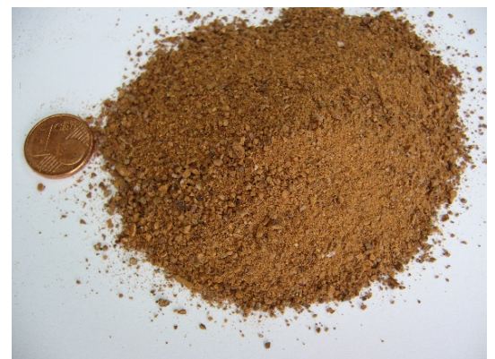
Fig. 5: 100 g cocoa after 1-minute grinding

The obtained fineness is sufficient enough though. The material becomes even finer, when sieved through a 2 mm sieve. A comminution by using the 1 mm sieve is unsuccessful. Tests to additionally increase the fineness by mixing with dry ice were not carried out. This would be a promising approach though to obtain an even finer, pourable powder in this manner.