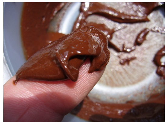
Fig. 2: Sensory testing

For the production of chocolate mostly industrial roller plants are utilized. The Mortar Grinder PULVERISETTE 2 passes the energy with pressure and friction to the material to be milled. The applied energy per time unit is much less as than with a planetary ball mill, which is optimized to the maximum impact energy. Therefore, the mortar grinder does not correspond any longer with the large-scale technical process.