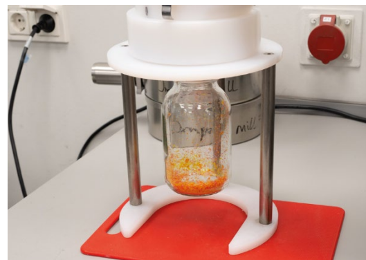
Fig. 3: Sample in sample glass of the small volume Cyclone separator

The trapezoidal perforation of the sieve shells 1 mm used in the cutting rotor were completely residue-free the after comminution and not clogged.