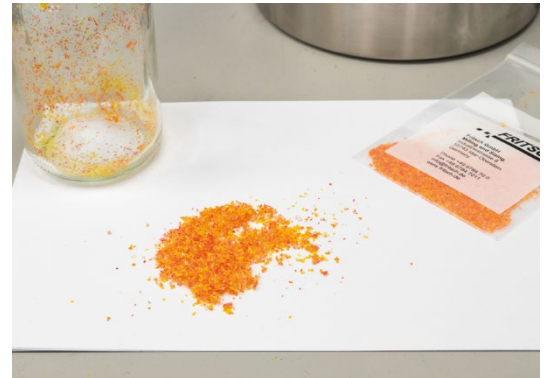
Fig. 4: Latex sample comminuted with 1 mm sieve shells with trapezoidal perforation

FRITSCH has suitable instruments in its portfolio for the comminution of latex products. These products can then be analysed in a further analysis for the use of solvents and toxic substances during production.