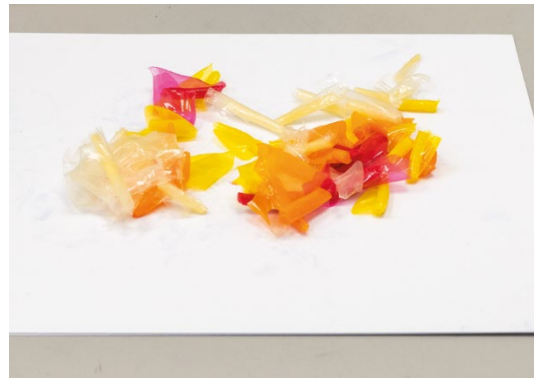
Fig. 1: Latex pre-cut down to 1 cm

The mill was operated at a speed of 20,000 rpm. The latex products were manually pre-shredded down to a feed size of 1 cm.